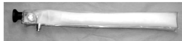
Figure 2 The warmer is applied as a sleeve around the laparoscope to warm the scope for a few minutes prior to surgery. The activation disc is by the eyepiece of the laparoscope

scope to stay warm during the entire procedure, without needing to take the scope out of the abdomen. This enabled the surgeon to perform the procedures safely and quickly. The duration of the procedures was shorter (mean 10 minutes) and the anatomical exposure of the abdomen was much clearer compared to our previous experience.