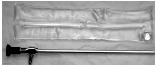
Figure 1 The disposable scope warmer (Single Use Sterile Pre-Surgical Scope Warmer) and a laparoscope. The warmer is activated by bending the disc in the bottom righthand corner

A common problem encountered during laparoscopic procedures is fogging of the scopes, which makes laparoscopy unsafe. To prevent fogging, reheating the scope outside the abdomen and use of anti-fog solution may be necessary, and this may need to be done frequently during the surgical procedure. The use of disposable scope warmers has made laparoscopy safer by preventing fogging.